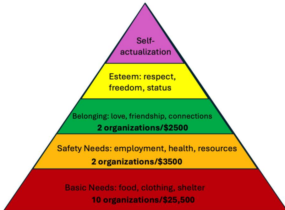
Spring Allocations based on Maslow's Hierarchy of Needs