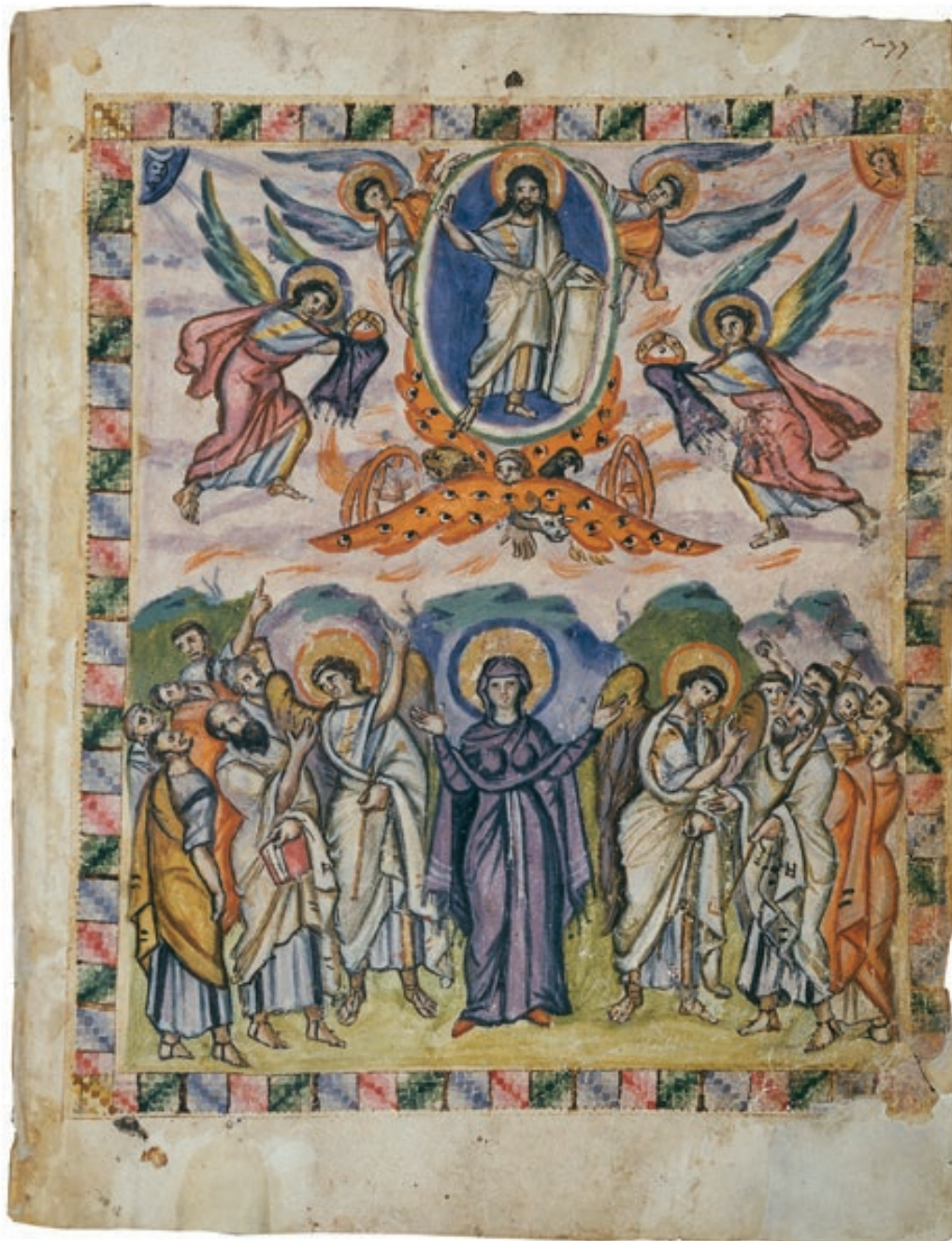
Ascension from the Rabbula Gospels, from Art in the Christian Tradition , a project of the Vanderbilt Divinity Library, Nashville, TN. https://diglib.library.vanderbilt.edu/act-imagelink.pl?RC=53846 [retrieved May 11, 2026].